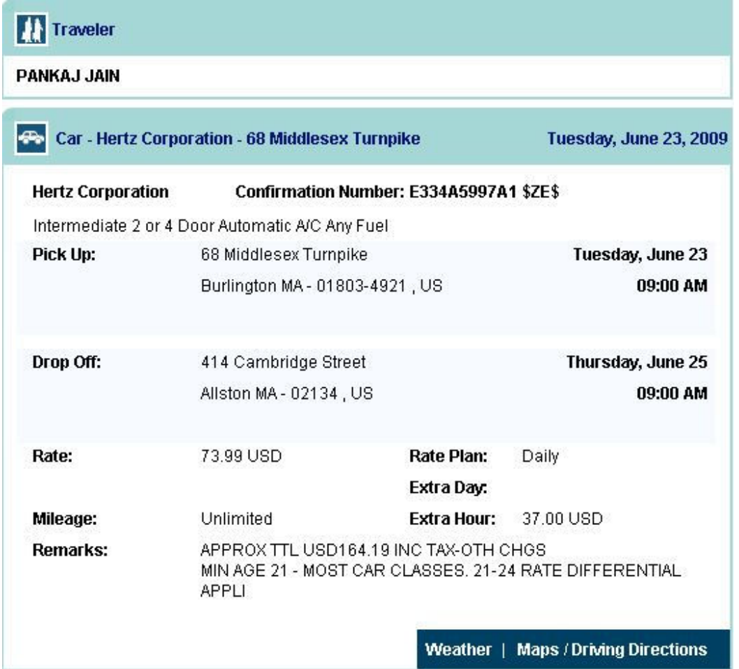
Figure 1 Example screenshot of how this information will be displayed.

1. If the car rental is to be picked up/dropped off at a location which is not at the airport, the address and details will be displayed in the car segment.